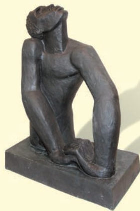
"Negro Aroused" ver. iii 1932, from a private collection exhibited at CAGE Gallery, Edna Manley College of the Visual and Performing Arts, with the Edna Manley Foundation, February 21 to March 2, 2006.

"Jamaican Art Movement" refers to the new anti-colonial mind-set of the 20th century. It began in 1922 when Edna Manley arrived on the island. Born as Edna Swithenbank, March 1, 1900, in Bournemouth, Yorkshire, to an