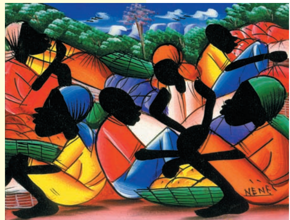
Nene, “Market Day,” from the Negril Craft Market