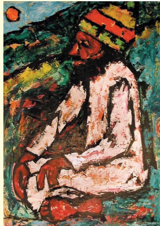
Karl Parboosingh, painting in the Reggae Series, from a private collection